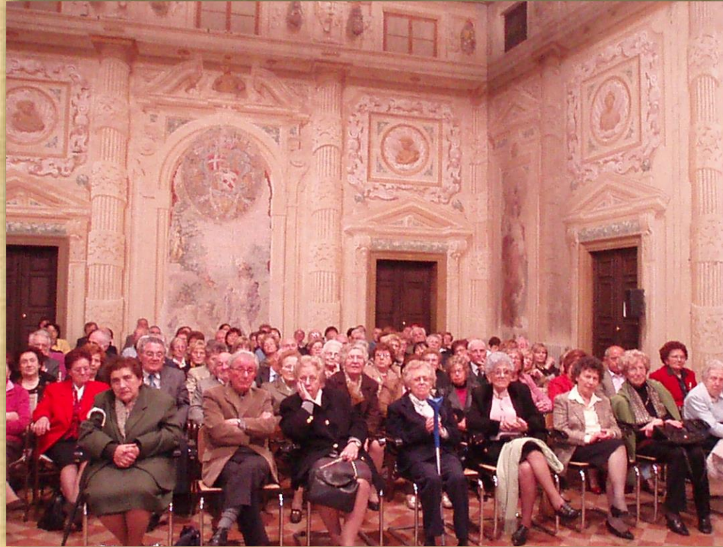
Some senior citizens at the University

It's a University for adults and elderly people. There aren't any exams, but only creative activities and interesting projects to stimulate one's mind and increase the people's curiosity. It's a place to make new friends and to develop one's interest to social life.