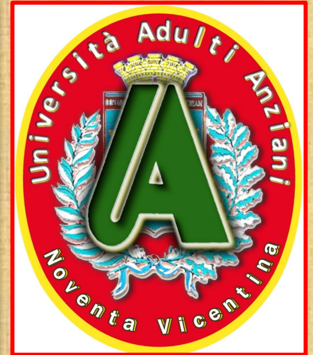
The logo of the University of the Third Age